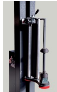
Film tension unit for lower wrapping costs