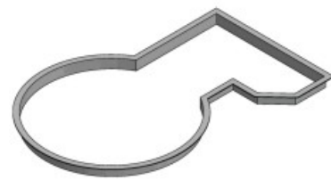
Underground template to create a flush operation surface