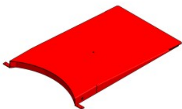
Loading ramp for pallet jack