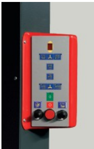
User friendly control panel